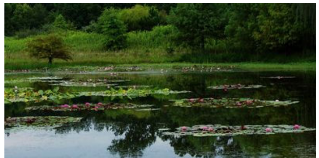
Water lily rafts at Otto Fajen’s –Becky Erickson