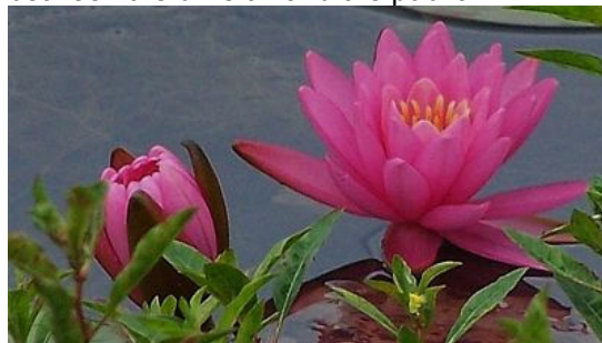
Pink water lily

The Missouri Department of Natural Resources, Division of State Parks has extended an invitation to the members of the Hawthorn Chapter of the Native Society to comment on plans for future development for Graham Cave State Park. An informational meeting will be held on September 19, 2006 from 7-9 pm at the Montgomery County R-II Senior High School, 394 North Hwy. 19, Montgomery City. Representatives from the Division of State Parks will present options on the long-range development plan for the park, the conceptual development plan, which was developed following public input. They will discuss the options, answer questions, and take comments. This informational meeting is supposed to facilitate communication between the division and the public.