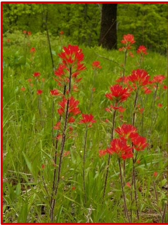
Paintbrush Castilleja coccinea A favorite for hummingbirds.