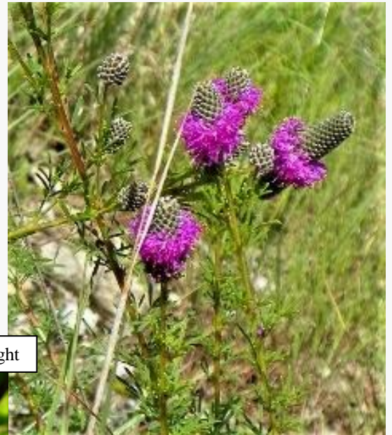
Matelia left. Monarda middle. Dalea right

Along Fish Hook Road we saw some plants new to me: milkweed vine [ Matelia ], scurfy pea [ Psoralia ], a robust colony of meadow rue [ Thalictrum ], and old favorites: alum root [ Heuchera ], prickly pear [ Opuntia ], colonies of bee balm [ Monarda ] were very busy feeding bees, and purple prairie clover [ Dalea ].