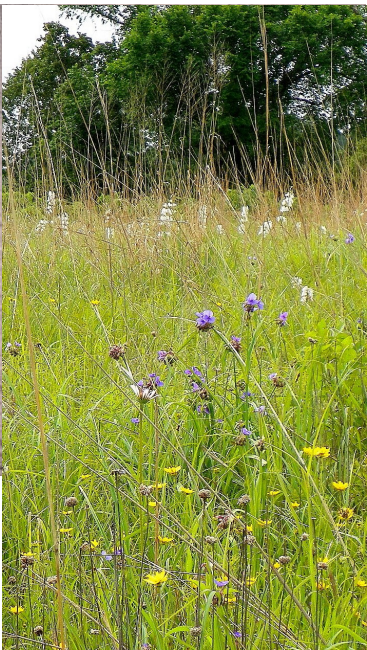
Tingler Prairie.

Membership: 369 members and 91 life members = holding steady. We all need to promote MONPS and recruit new paying members.