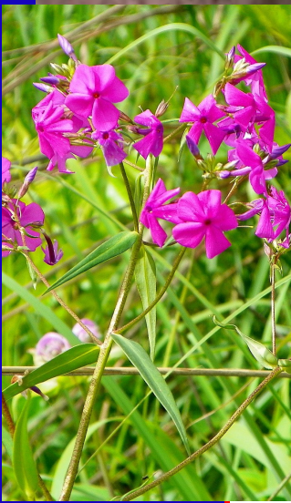
Swamp Phlox.

MONPS Spring meeting was in the West Plains area 2-4 June.