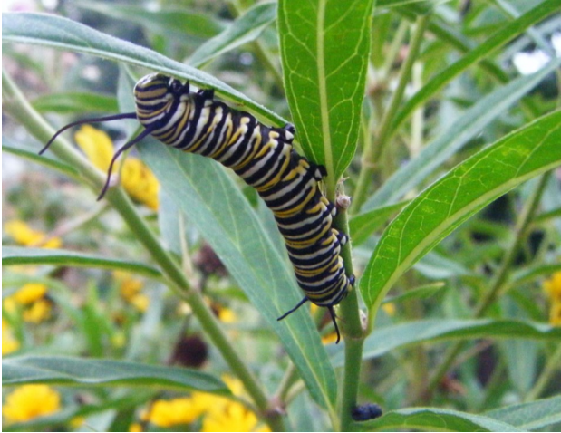
Monarch larvae to the left and immature Milkweed Bugs to the right.