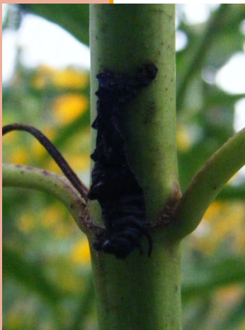
Dead Monarch Larvae above and Wheel Bug with Great Golden Digger Wasp to the right.