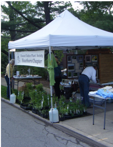
Chapter Booth at Earth Day in 2015.

The event will take place on April 24th unless it is rained out, and in that case it will be rescheduled to May 1st). It will run from noon to 6:30 pm, but we must have the booth set up and have cars off the street by 11:00 am.