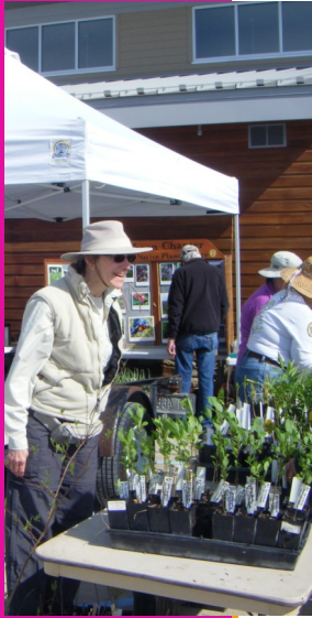
Our Chapter Booth at the Bradford Farm Plant Sale from 2015.