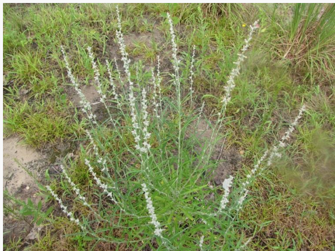
Wand blackroot.

I want to share with ya'll my first submission to the Flora of Texas database. Photos attached. The Flora of Texas database is part of the University of Texas Herbarium Plant Resources Center. I was quite surprised when I was notified that my specimen had been accepted! The plant is Pterocaulon virgatum , common name Wand blackroot, a plant species widespread in Latin America and in the West Indies. In the United States, it has been reported only from Texas and Louisiana. It supposedly grows in marshy areas, ditches, sandy loam, etc. It took a friend, who is a self taught botanist, and I a month to determine the identification of this plant. I have now discovered at least 5 more of them growing on my property, which has no marshy area or even sandy loam. The soil here is mainly sand over red clay, with rocks thrown in for good measure! It is just now beginning to show its flower buds.