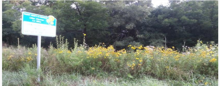
of the Stadium Site