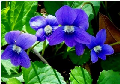
Blue violet, Bloodroot, Bluebells.

Sutu is very willing for interested people to access these acres by entering on foot, south of her home at 627 Bluffdale. (A trail along the creek through several backyards leads to the chat and fescue city easement. Her phone is 573-449-2955.)