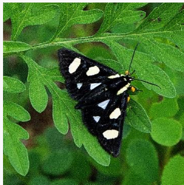
Eight-spotted forester, a diurnal moth who sips flower nectar. Cicadas had hatched and we

flushed flocks of them as we moseyed through the prairie vegetation.