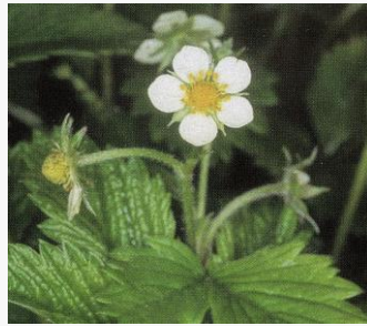
Fragaria NL photos

Of course, had I brought a field guide I wouldn't have been confused, but I didn't want to carry anything extra on the long hours hiking up and down those glorious hills. I did buy a small book on Tuscan plants. You're welcome to take a look at it at the July 12 th party, but for those of you who can't attend, I'm sharing a few photos.