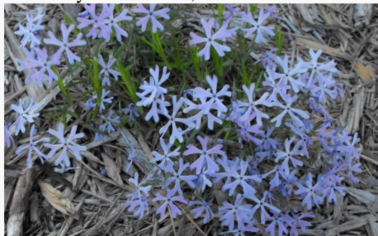
... And it can bloom again near 1 April.