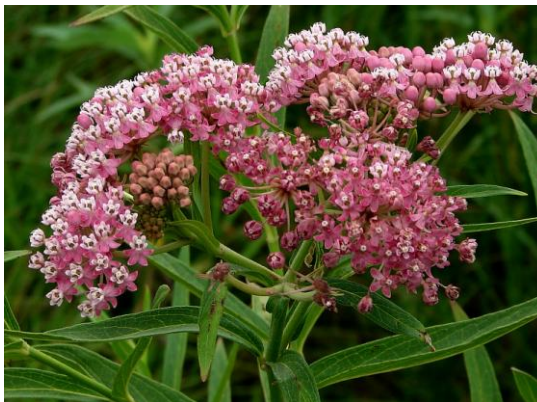
Swamp or rose milkweed is the preferred food for monarch larvae.

Like many native plant species, milkweed populations are being lost at a rapid rate due to urban and suburban development and agricultural intensification. Despite their native status, unique beauty, and value to the monarch butterfly as well as to a tremendous range of pollinators and other beneficial insects, milkweeds are often perceived as crop weeds or a threat to livestock and eradicated from agricultural areas, rangelands, and roadsides.