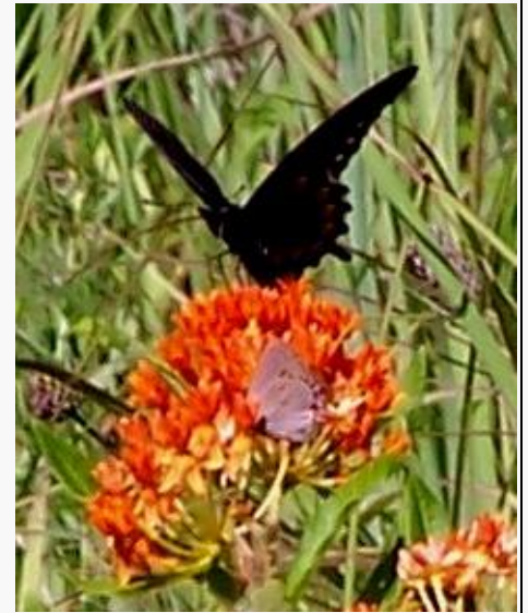
Swallowtail and little blues on butterfly weed