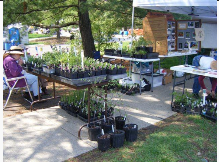
Earth Day in Columbia

We have three small tables and two display boards that need to be stored in a dry place between set-ups. All fold up flat and can be set up vertically on the back wall of a basement or garage.