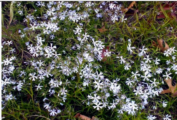
Sand phlox blooms in native garden at Allen Hall on LU campus in December 2012; yes really!