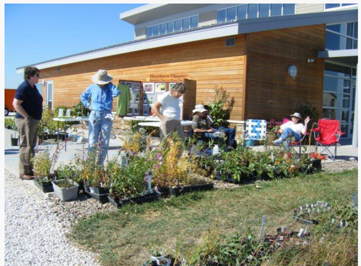
Fall sale at Bradford Farm

We are asking for only a few days in the spring and a couple of days in the fall for you to help with an effort to inspire people to get back in touch with nature and understand the value of our native vegetation.