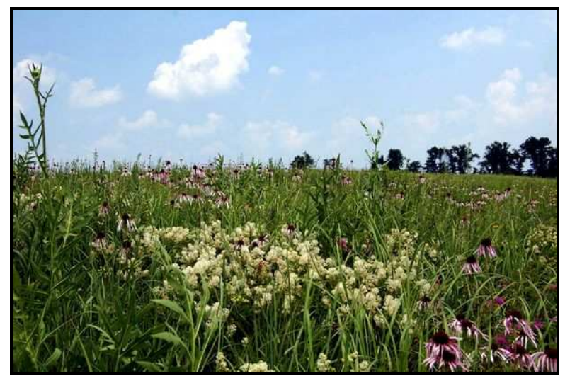
NJ tea and Pale purple coneflowers at Morris