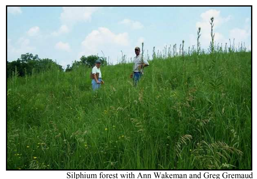
Goat's rue