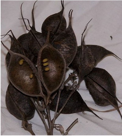
Baptisia bracteata pod —Becky Erickson