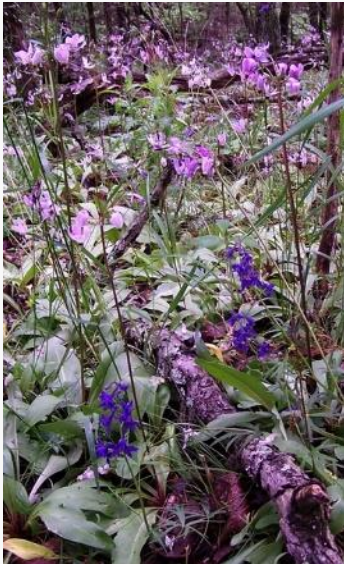
[ Primula meadii ]