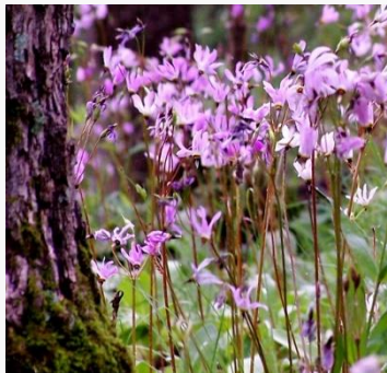
[BE photo Primula meadii ]

birdsafekc@burroughs.org to discuss solutions.