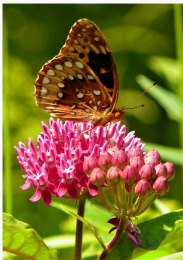
Spangled fritillary on Asclepias purpureascens