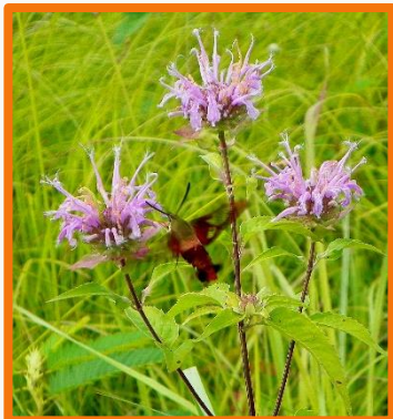
Beebalm Monarda fistulosa A favorite for hawk moths.