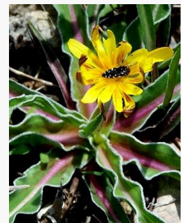
[rare] Kregia sp.