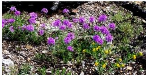
Glandularia canadensis and Lithospermum canescens