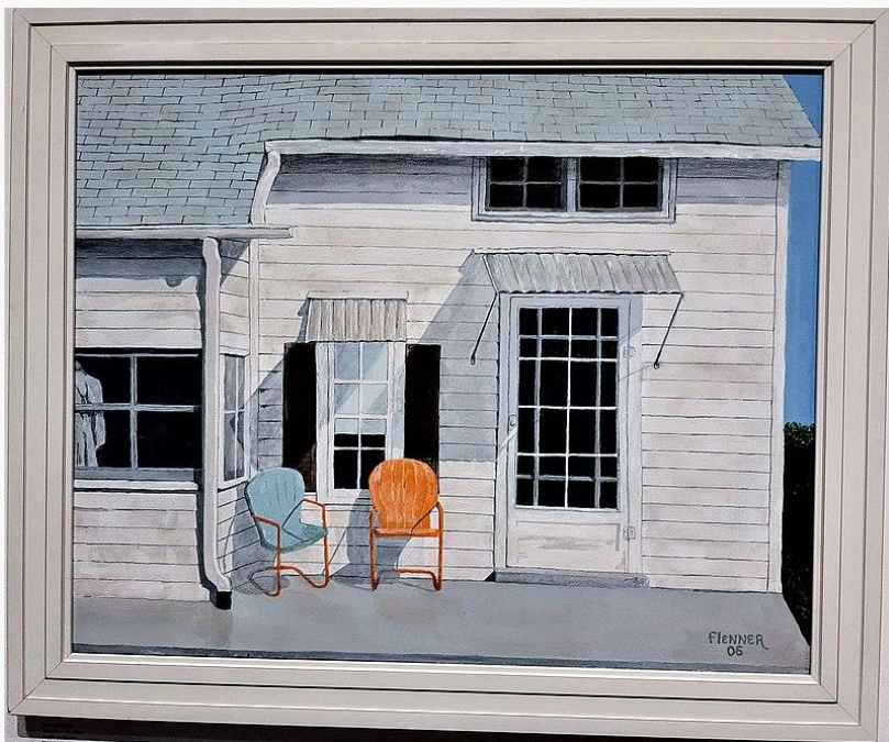
Below is Old Cody Place by George Flenner