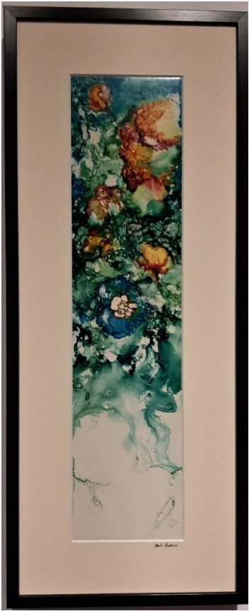
Above is Flowers by Gail Raskin

The Gallery is located in the Boone County History & Culture Center, 3801 Ponderosa St., Columbia. This is the rustic building with flags in front, on US63 just south of Grindstone Pkwy. The Winter Show will be on display until January 26, 2020. Gallery hours are Wed.-Sat: 10-5, Sun: Noon-5. Phone: 573-443-8936.