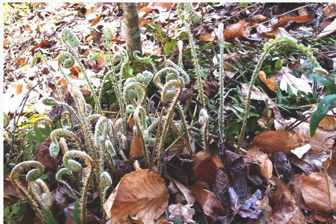
Christmas fern fiddleheads