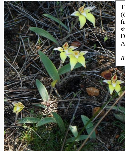
The cowslip orchid ( Caladenia flavia ) in full bloom in native shrubland near Dallwallinu, Western Australia Sept 2012.

There is STILL a very sturdy hand built table we used at our booth displays for many years being stored at Becky's house. This 3X8 foot table has a thick, varnished, plywood top with 3" skirting, heavy folding legs. It would cost much more than $100 for the materials and the time it takes to build a comparable table [possibly $400]. $100 goes back into the NPS account. Please call Becky for viewing, sale, and pickup. 657-2314