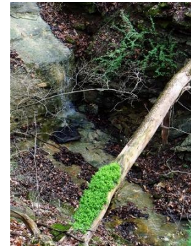
Waterfall just below daffodil patch