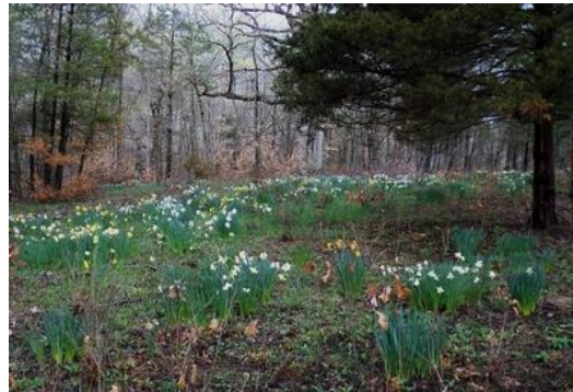
Famous daffodil patch