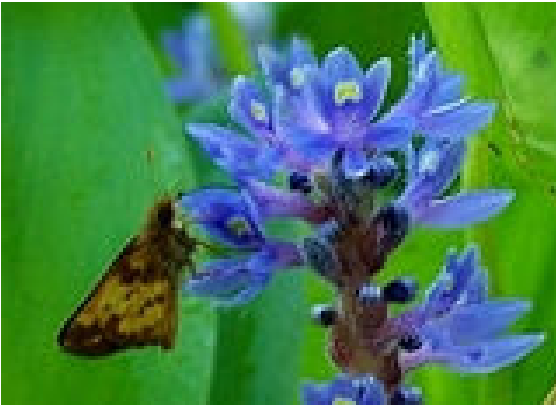
Hobomok skipper on Pickerel BE photo