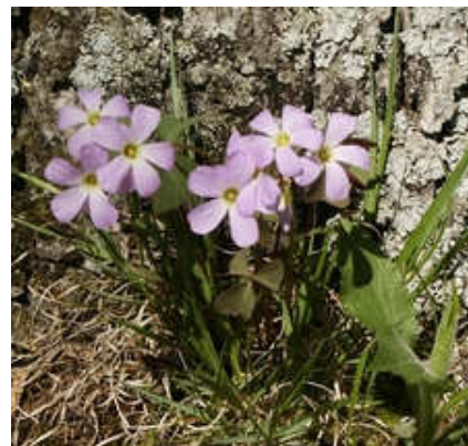
Photographs of 2006 Spring wildflowers, from left to right, top to bottom: Bluebells, Jack-in-the-pulpit, Flowering dogwood, Violet wood sorrel, Bellwort, and Missouri violet